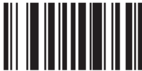
Set Factory Defaults

These codes can also be found in the LS4278 Reference Guide .