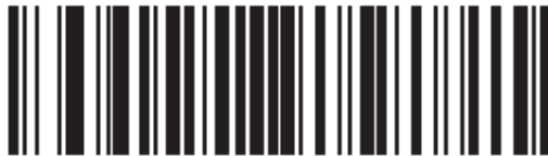
Serial Port Profile (Slave)